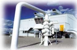
PIPELINE & COMPRESSION

Our process safety heritage and automation roots make SSECI the ideal partner to support your upcoming automation project with a certified RAGAGEP project implementation model. Our vendor partnerships provides you with a best in class solution that leverages tested logic libraries to ensure your system is safely integrated for maximum shareholder benefit.