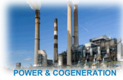
POWER & COGENERATION