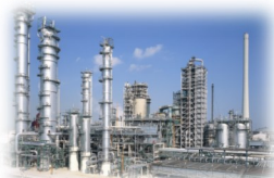
REFINING & PETRO-CHEM